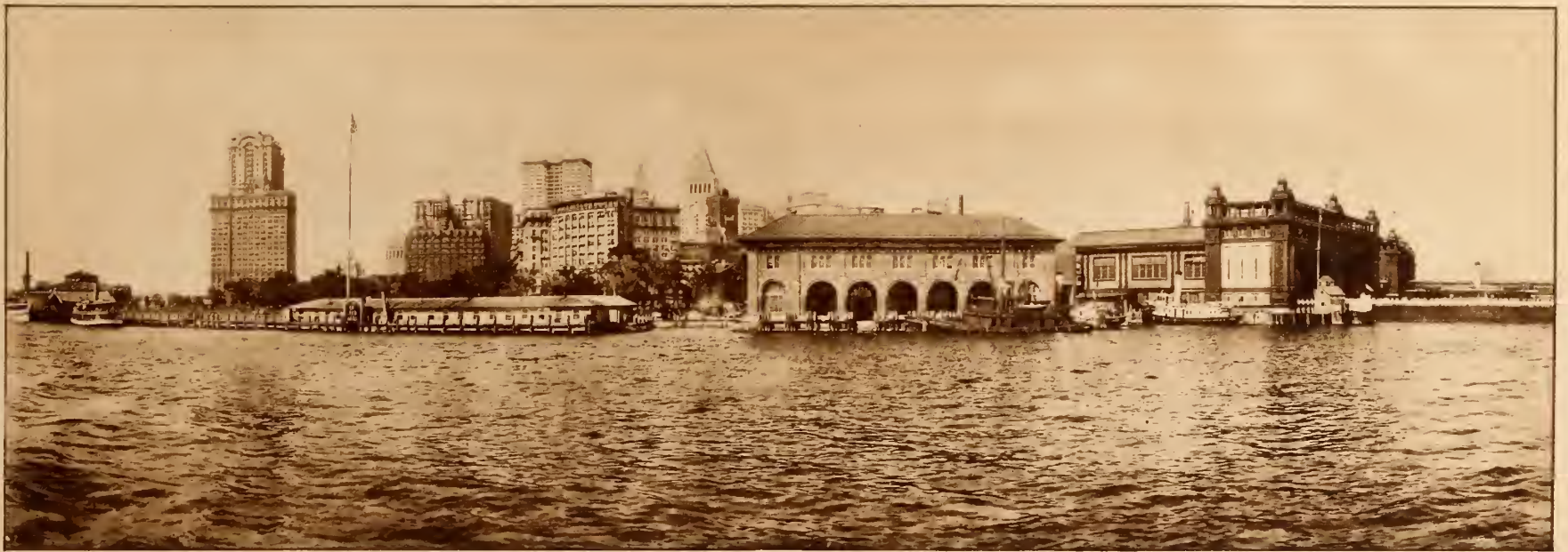
VIEW OF BATTERY PARK FROM GOVERNOR'S ISLAND. In front are the Staten Island and South Brooklyn ferries, connecting Manhattan and the other boroughs.